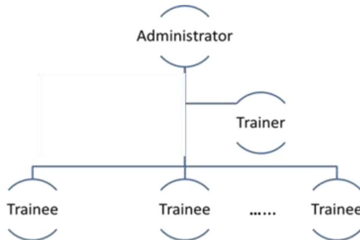
Figure 2: Roles foreseen within the 21 st Teach Skills project eLearning platform.

The roles described above can be illustrated schematically as shown in Figure 2.